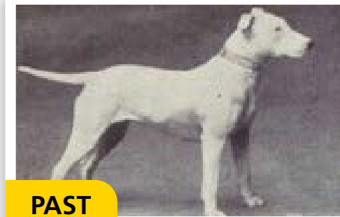
English Bull Terrier